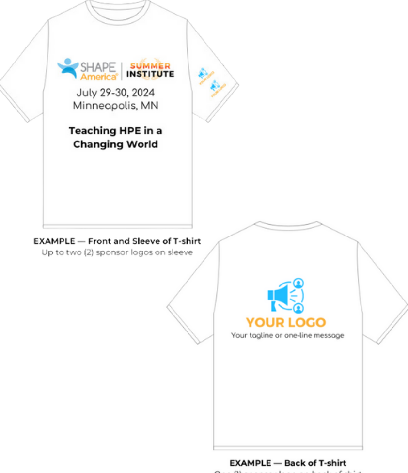
One (1) sponsor logo on back of shirt